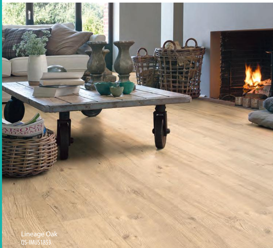
Lineage Oak QS-IMUS1853

One of the most advanced laminates, Envique offers realism at its best – truly innovative and dramatic.