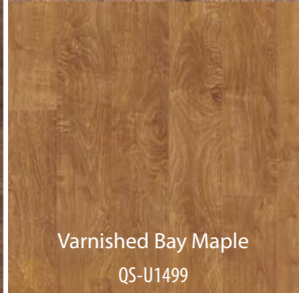
Varnished Bay Maple QS-U1499