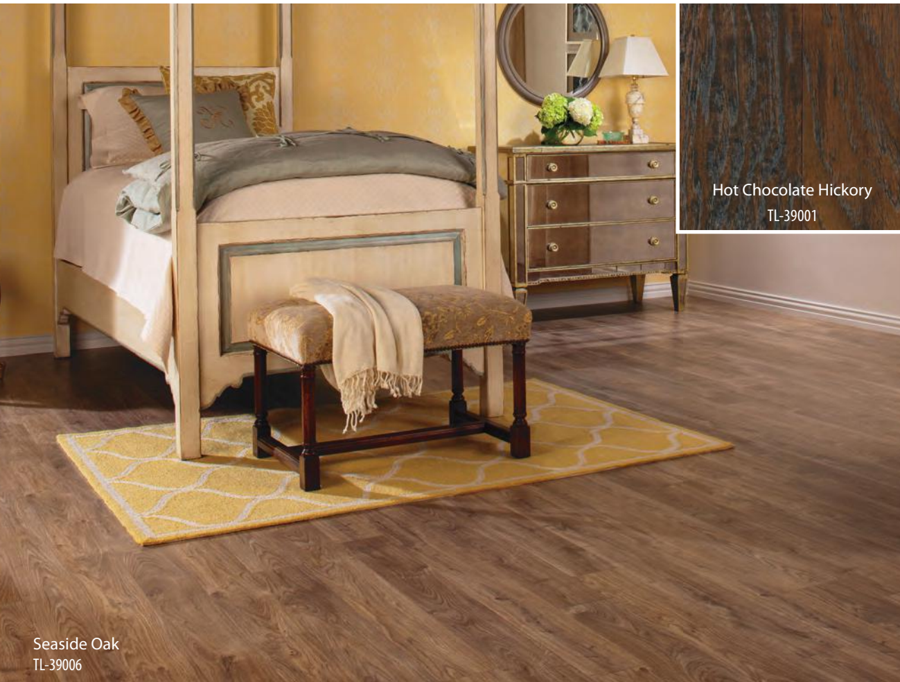
Seaside Oak TL-39006