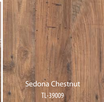
Sedona Chestnut TL-39009